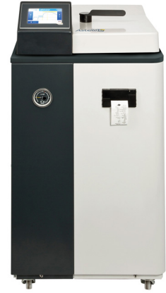
A typical AMA440

These are the base options. Steam and vacuum system upgrades are available for most Astell Autoclaves. Ask your sales person for more info.