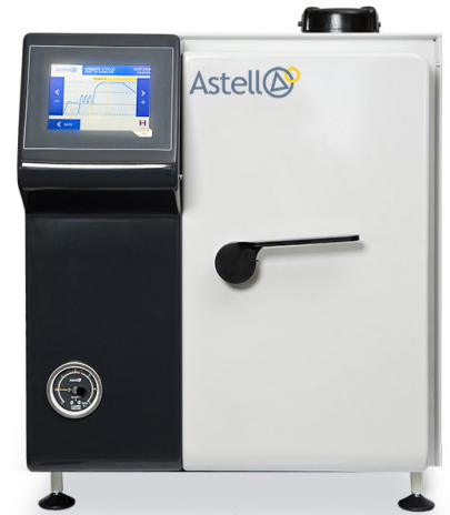
A typical AMB220

These are the base options. Steam and vacuum system upgrades are available for most Astell Autoclaves. Ask your sales person for more info.