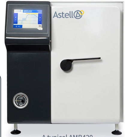
A typical AMB420

These are the base options. Steam and vacuum system upgrades are available for most Astell Autoclaves. Ask your sales person for more info.