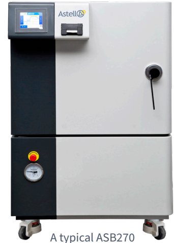
A typical ASB270

These are the base options. Steam and vacuum system upgrades are available for most Astell Autoclaves. Ask your sales person for more info.